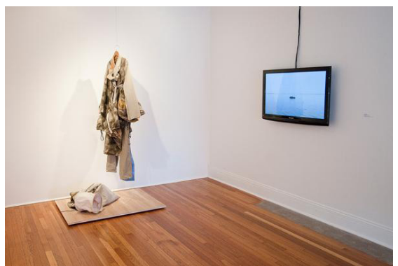
Mattingly, Mary. "Wearable Homes," 2004-present. Outlast/Adaptive Comfort, Cordura, Solarweave.