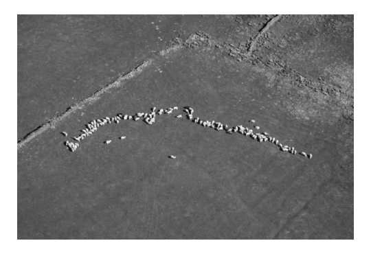
Aerial view of sheep in fields.

early human trails and roads can be traced back to the paths that animals took in order to find salt and minerals.