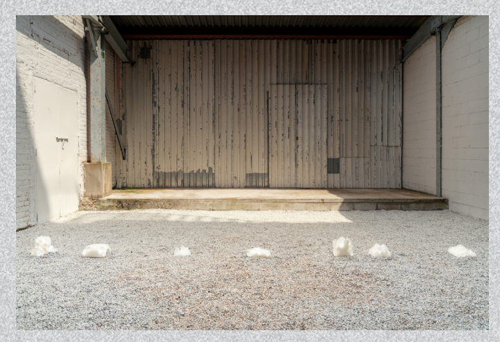
Documentation of Saltliths installed at Spencer Brownstone Gallery in July 2019.