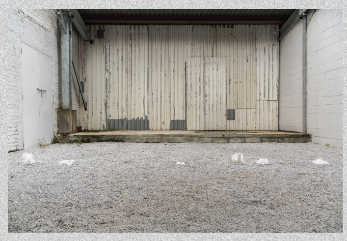
Documentation of Saltliths installed at Spencer Brownstone Gallery in September 2019.