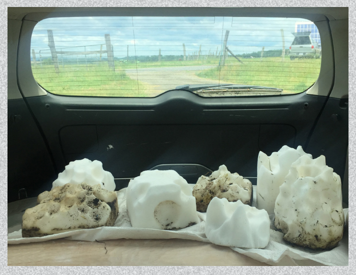
Saltliths leaving the farm, 2019.