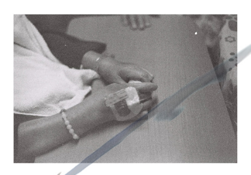
chicken wire, grandma, don't be sad.