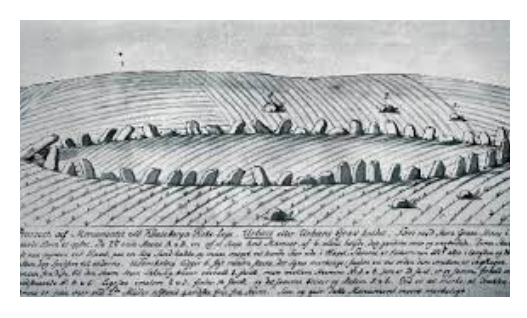
Drawing of Ales Stenar by C.G.G Hilfelings in 1777. Ales stones is a megalithic monument from the nordic iron age located on the coast in the south of Sweden.

After cleaning the salts from the dirt they collected in the muddy fields, I installed the licks lined up in the gravel of the gallery courtyard, each like a contained landscape model with varying terrain. I titled the piece Saltliths as a nod to the risen megalith stones that prehistoric humans marked landscapes with. In many cases, the stones used for neolithic monuments that had no quarry nearby had been deposited there by glacial ice. The exhibition, curated by Jae Cho, was titled Erratics , in reference to glacial erratics, stones that migrate with ice sheets to landscapes far from their origin and often dropped in peculiar places and positions. The works on view all explored, in various ways, how to connect physically with the vastness of geologic time. It included sculptures that I had made in clay which felt to me as compressed performances on how stones are made and how they weather over time. As I was working on the ceramic pieces I was thinking of how the clay was sediment: shaped, sponged smooth and then fired to sedimentary stone like structures.