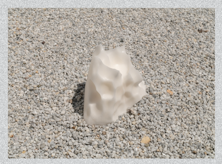
Detail of Saltliths, 2019. Image courtesy Adam Kremer.