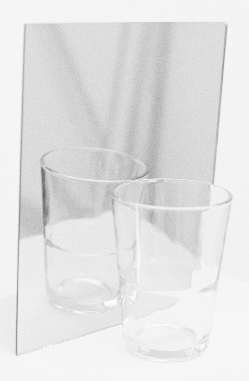
COLUMBIA UNIVERSITY IN THE CITY OF NEW YORK